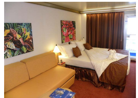
Balcony cabin, Carnival Magic