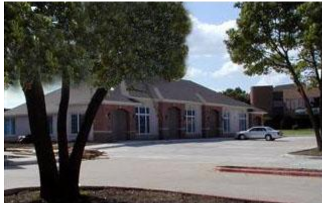
Alpha State Headquarters, 6220 Campbell Road, Suite 204, Dallas